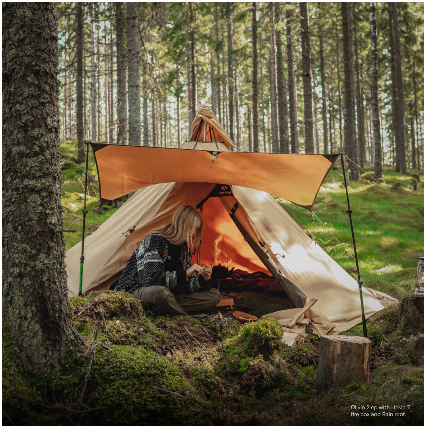
Olivin 2 cp with Hekla 7 fire box and Rain roof.