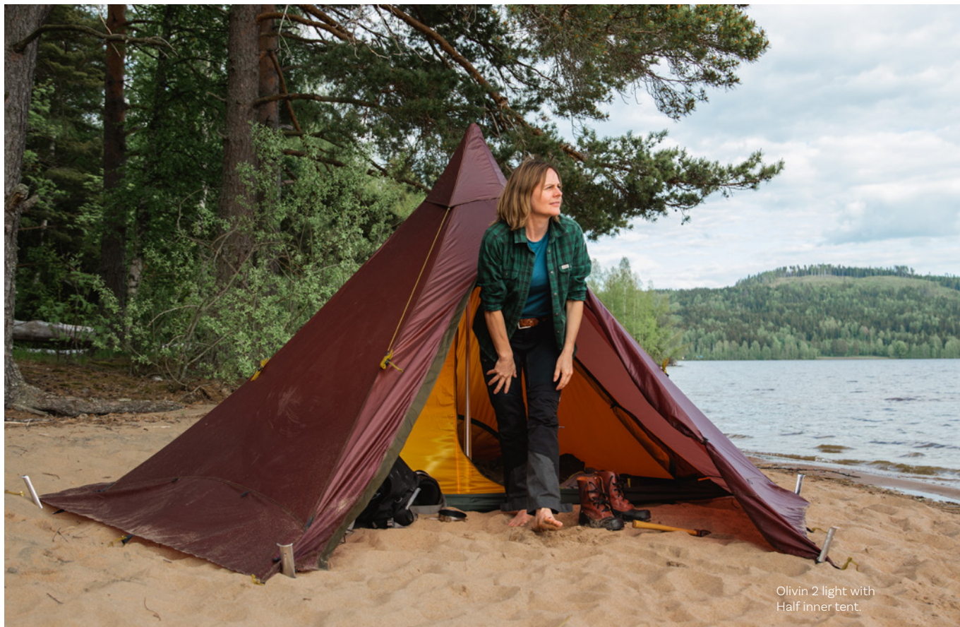
Olivin 2 light with Half inner tent.