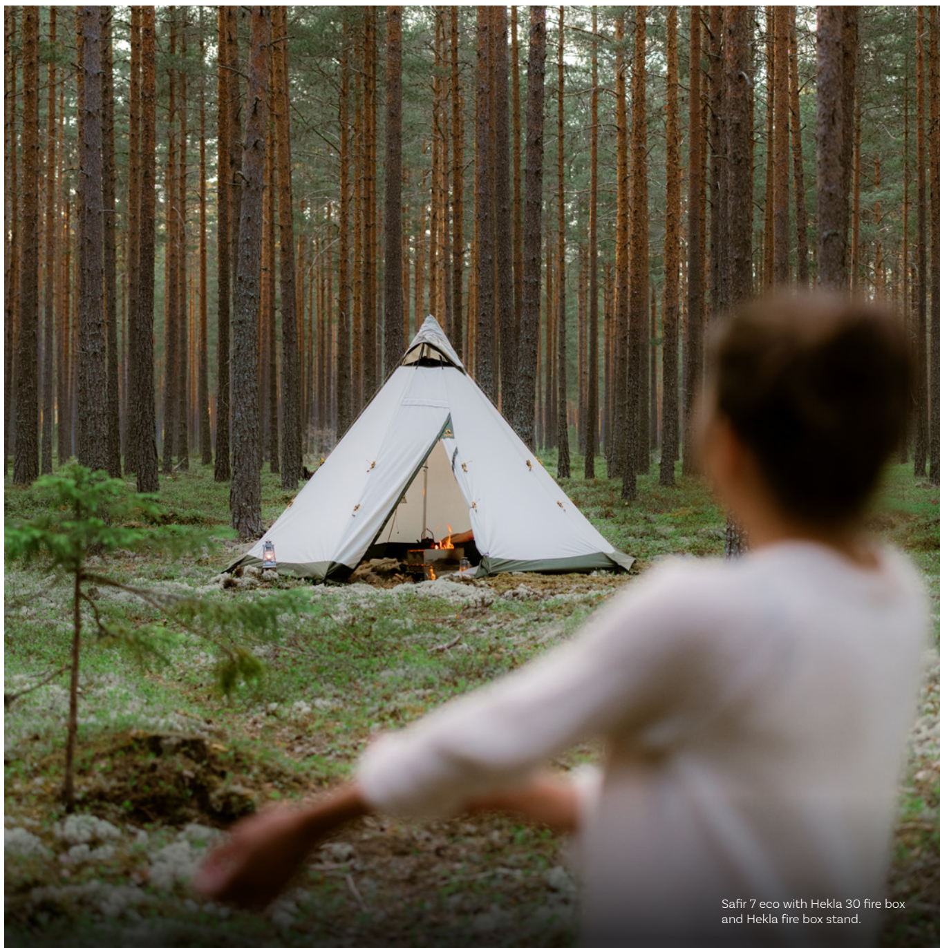
Safir 7 eco with Hekla 30 fire box and Hekla fire box stand.