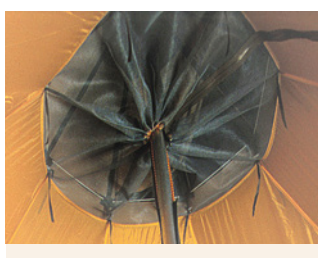
Closable insect net.