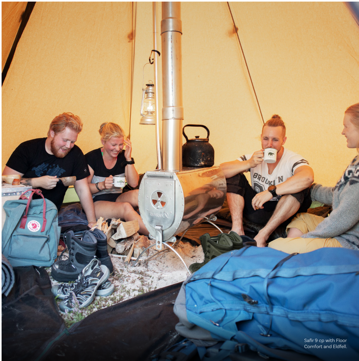
Safir 9 cp with Floor Comfort and Eldfell.